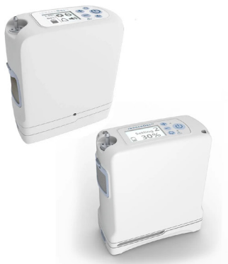
Portable Concentrators from Inogen, Rhythm Healthcare Respironics and Caire