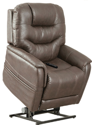
Lift Chairs from Pride Mobility and Golden Technologies

Come see us for the best prices around and the largest selection of high quality Home Medical Equipment and Supplies